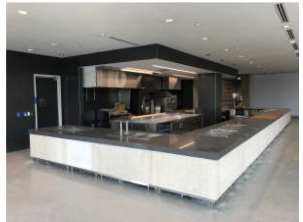
Smokehouse Tile and Countertops