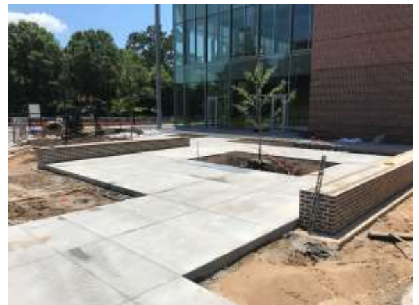
Completing Sitework East of the Hub