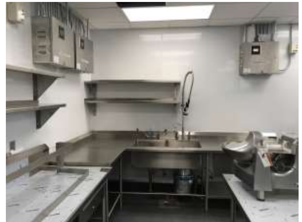
Hub 3 rd Floor Main Kitchen