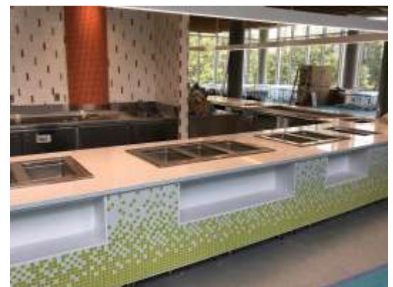
Pizza/Garden Tile and Countertops