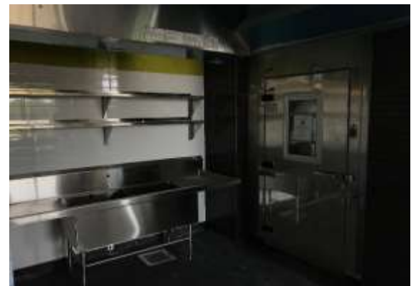
International Kitchen Equipment Installation