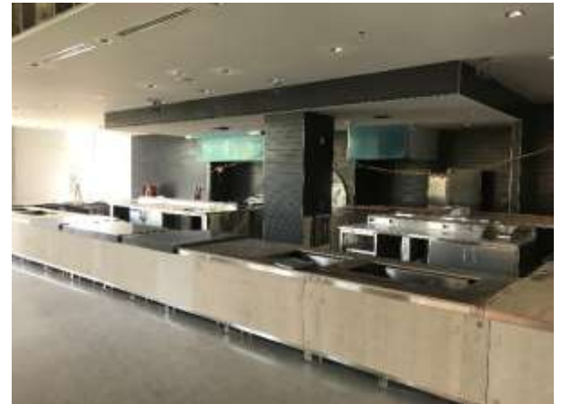
Smokehouse Kitchen Equipment Installation