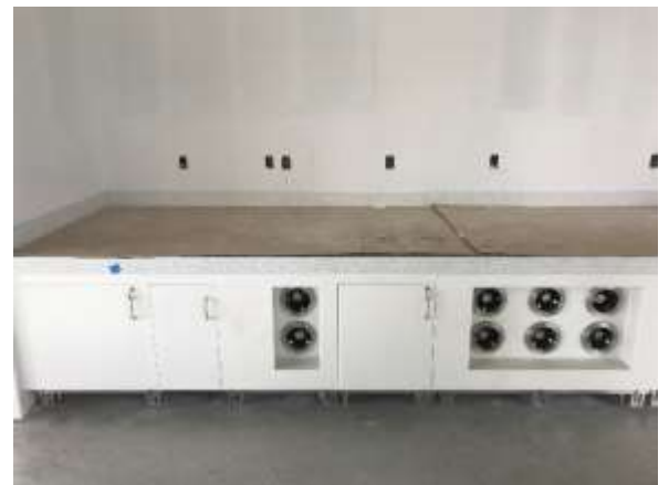
Hub 3 rd Floor West Beverage Fountain Cabinet Installation