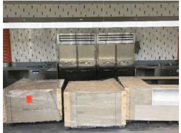
Pizza Garden Kitchen Equipment Installation