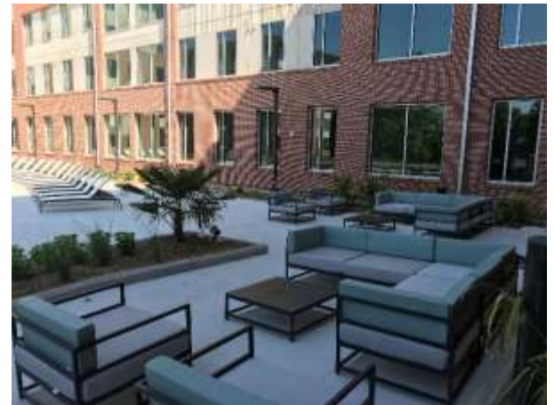
Building B Pool Furniture