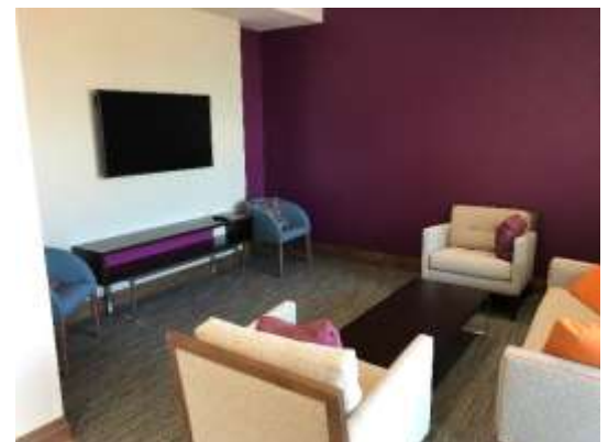
Building A Lobby Seating Area