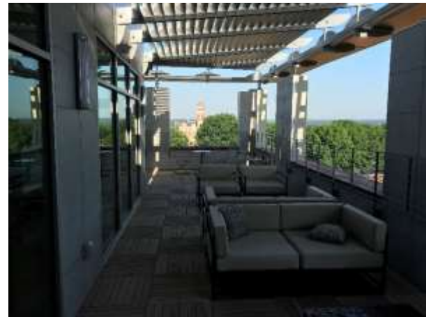
Building A Terrace Furniture