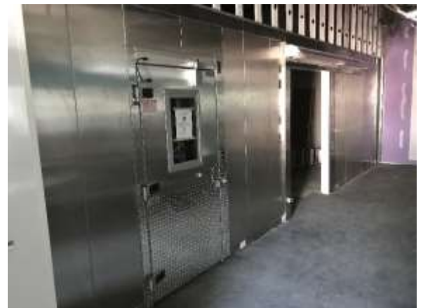
Hub 3 rd Floor Freezer Installation