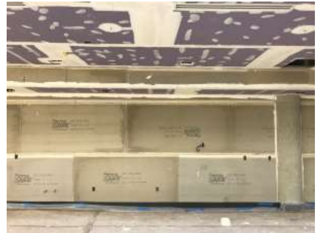
Wall and Ceiling Cover-up Hub 3 rd Floor