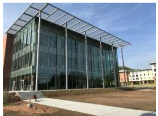
Hub Area Grading and Sidewalks