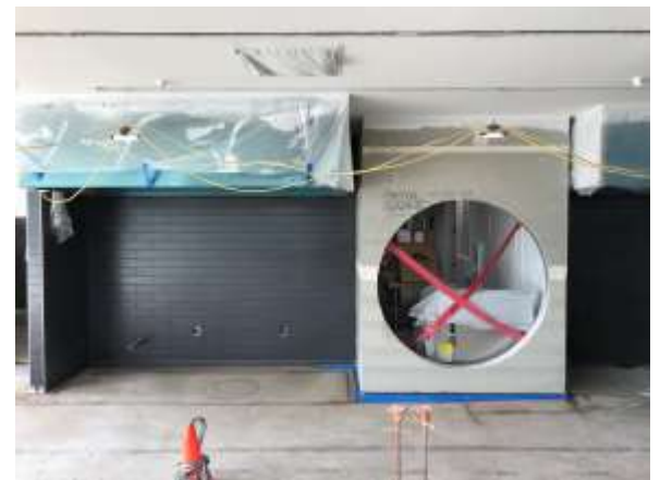
Hub Wall Tile and Kitchen Equipment