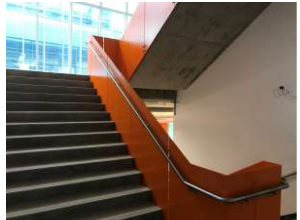
Hub Stair Handrails