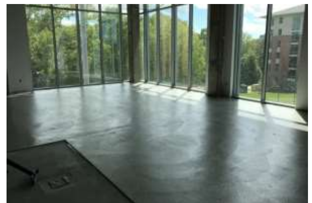
Terrazo Installation Hub 3 rd Floor