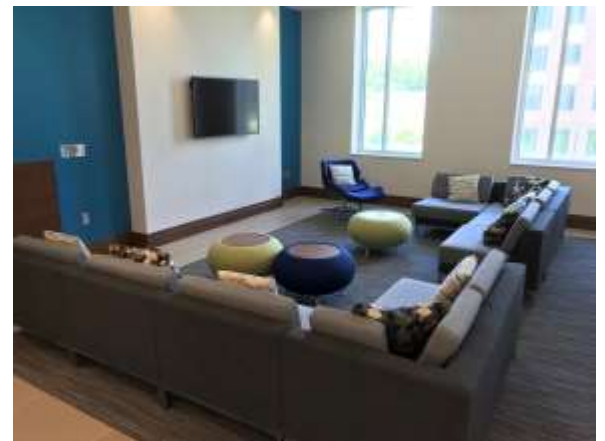
Building B Lounge Area Furniture Completion