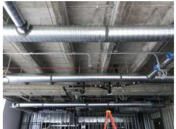
Ductwork Installation Hub 2 nd Floor