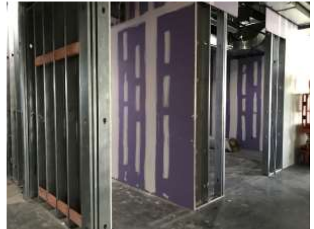
Hanging and Finishing Drywall Hub 2 nd Floor