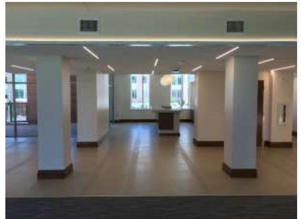
Building B Lobby