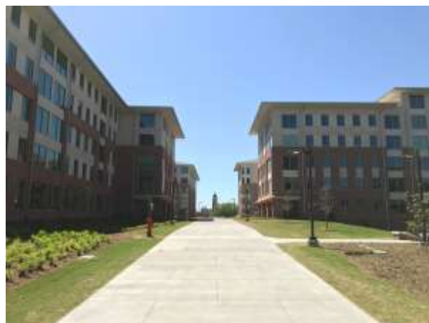
West Zone from the Spine Road