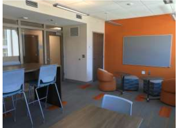
Building E Study Room