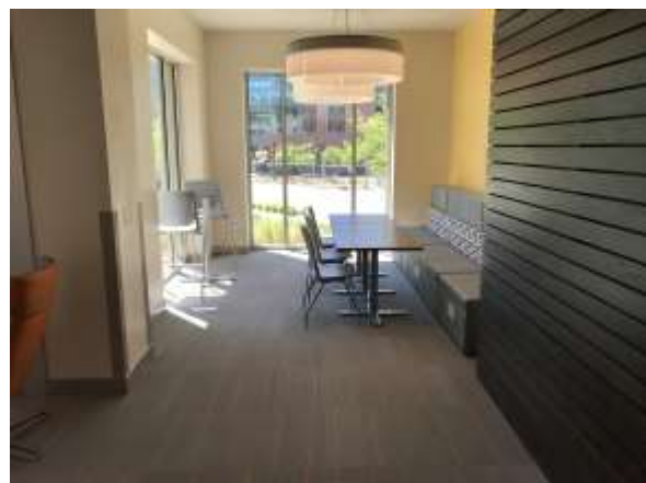
Building E Lounge Area