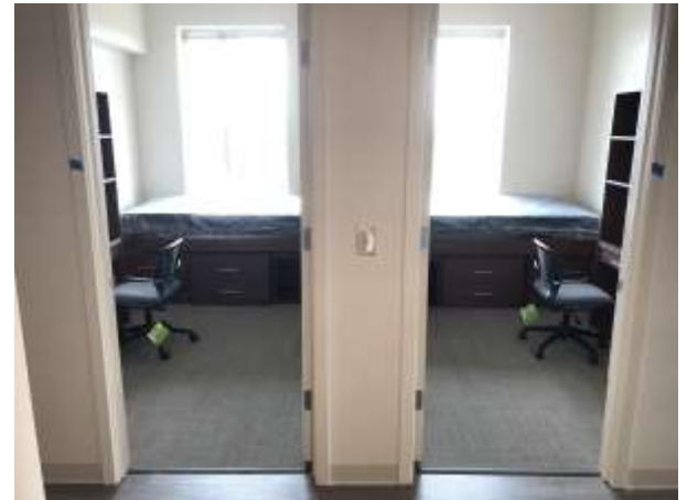
West Zone Apartment Furniture