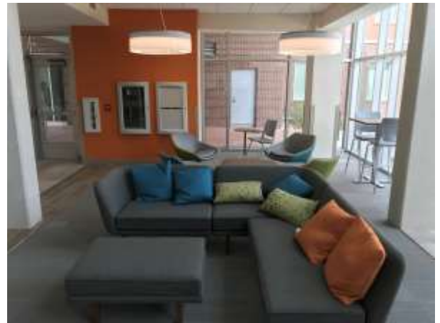
East Zone Lobby Furniture