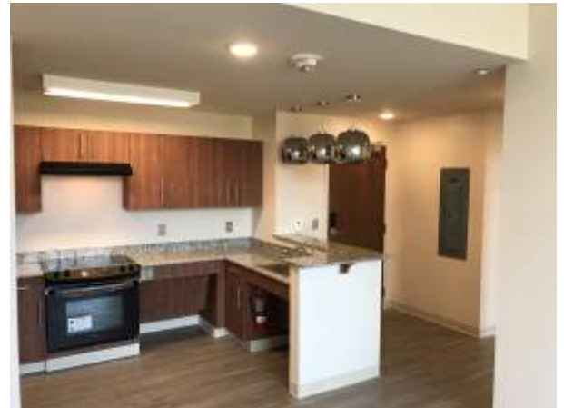
Building D Appliance Installation