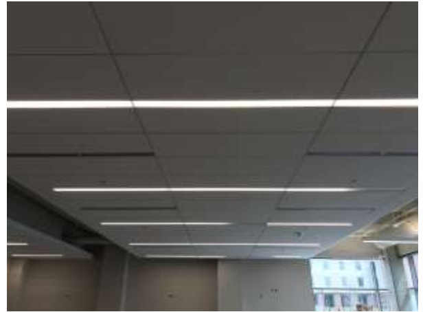
HUB 1 st Floor Ceiling Tile Install