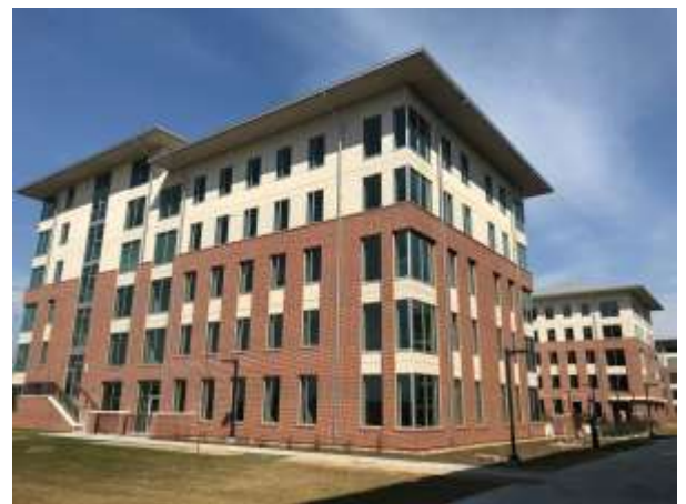
Building B Window Cleaning