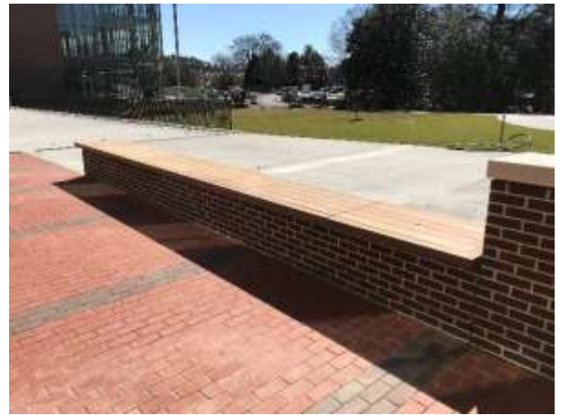
Wood Slat Seat Walls