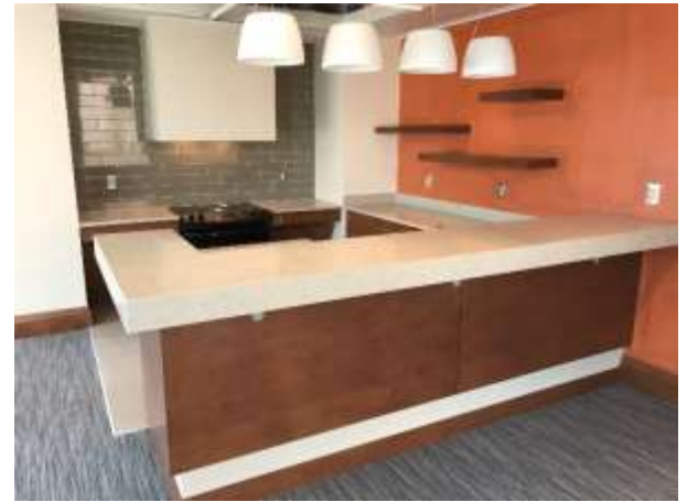
Building D Lobby