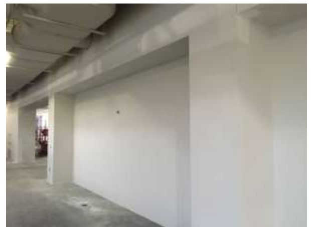
HUB Barnes and Noble Painting