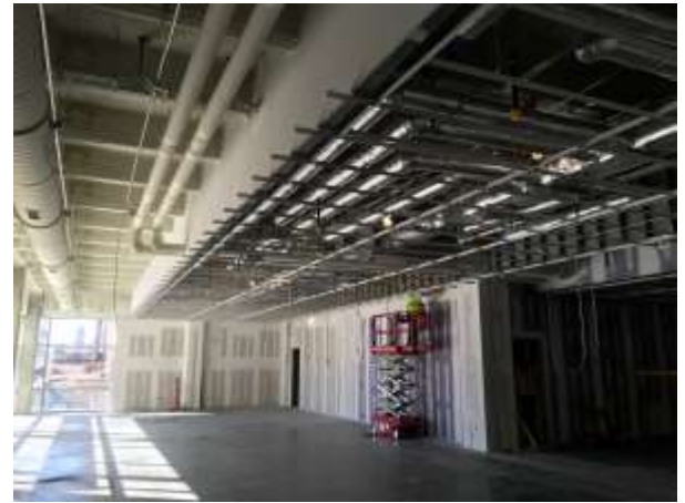
HUB Barnes and Noble Ceiling Grid