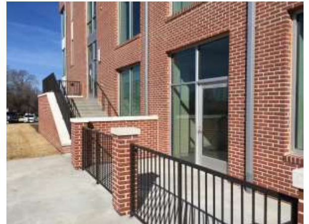
Building B Exterior Handrails