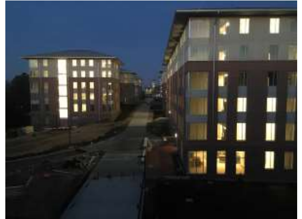
West Zone Spine Road