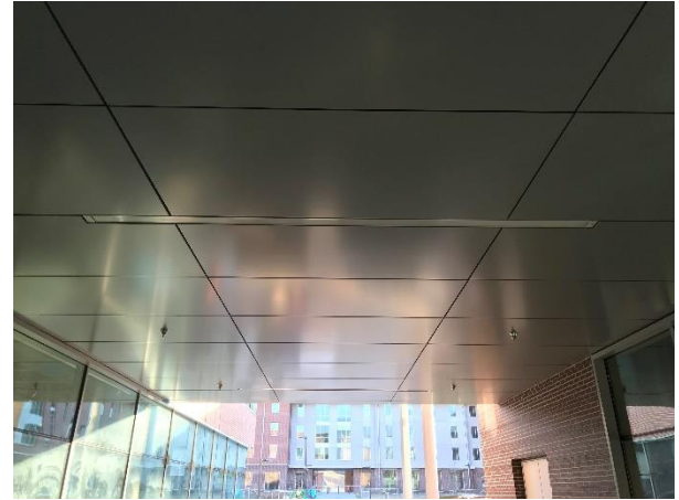
HUB Breezeway Metal Panel Installation