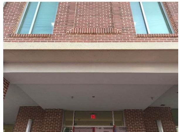
Building B Breezeway DEFS Complete