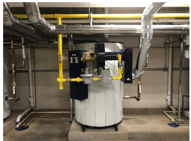
BL-1 Mechanical Room Rough Clean