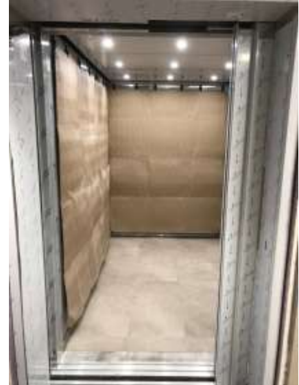
Elevator Final Inspection Building B