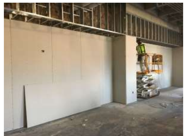
Insulating & Hanging Drywall in Barnes & Noble