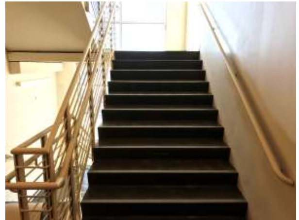
Stair Treads Completed Building B