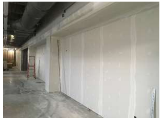
Finishing Drywall in Barnes & Noble