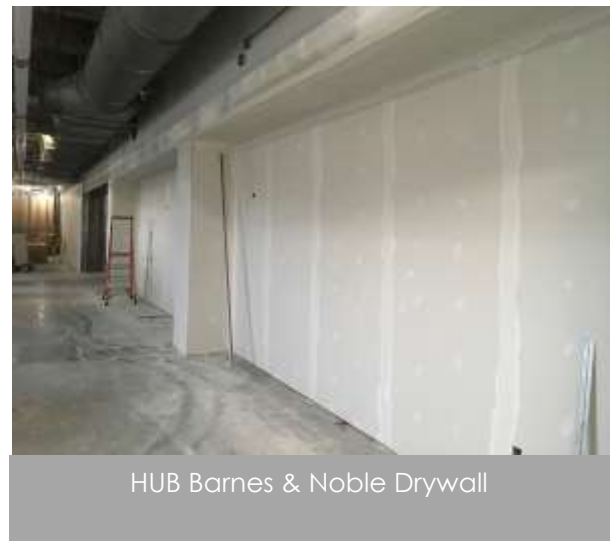
HUB Barnes & Noble Drywall