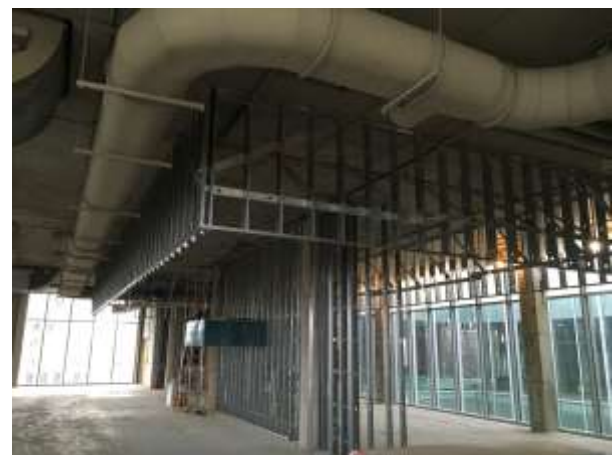
HUB Served Garden/Pizza Soffit Framing