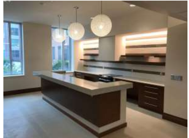
Final Coat of Paint B1 Lobby