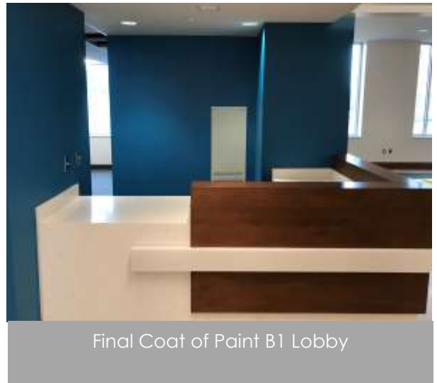
Final Coat of Paint B1 Lobby