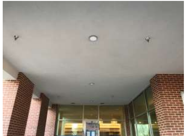
Building B Breezeway Trim-out