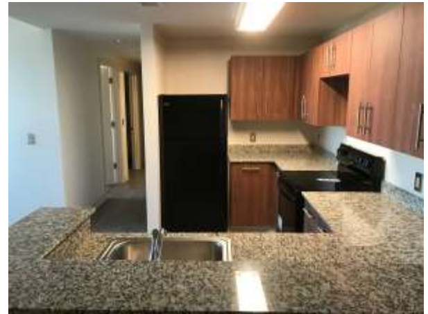
Appliance Installation in B4 Unit