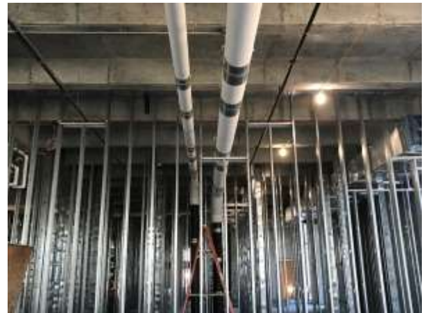
Hydronic Piping HUB 3 RD Floor