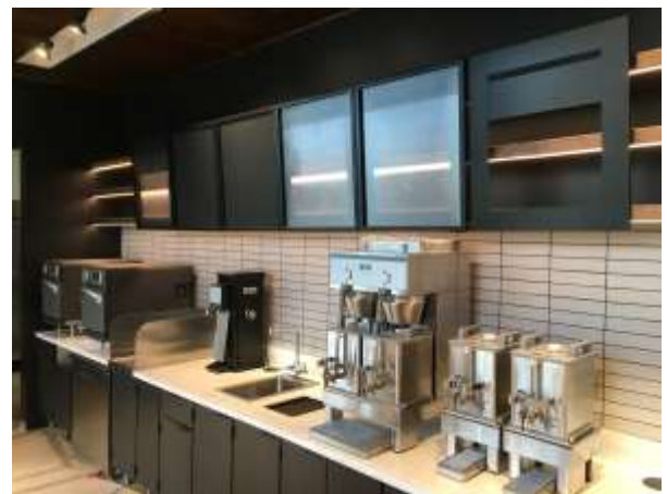
HUB Starbucks Bar