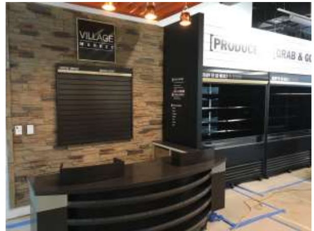
HUB Fresh Market