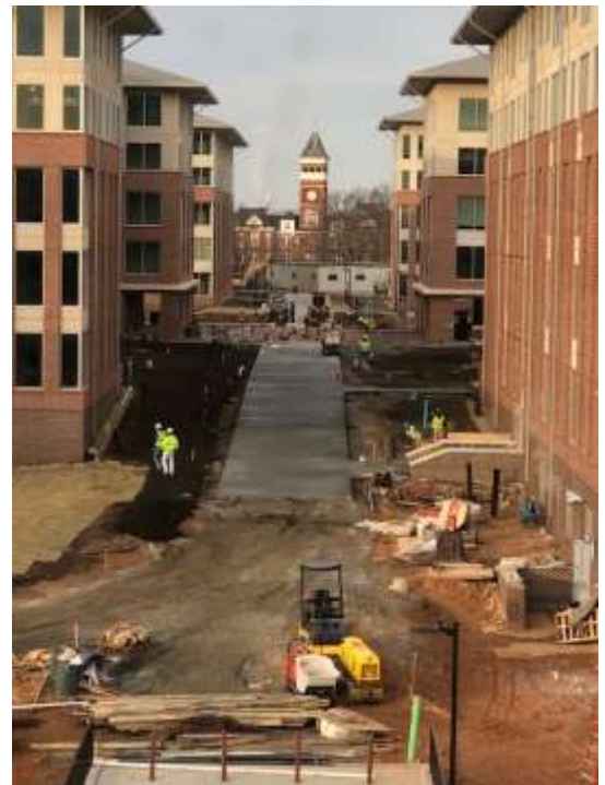
West Spine Progress