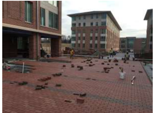
Brick Paver Install at Buildings B & C