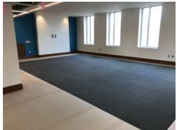
Building B Lobby