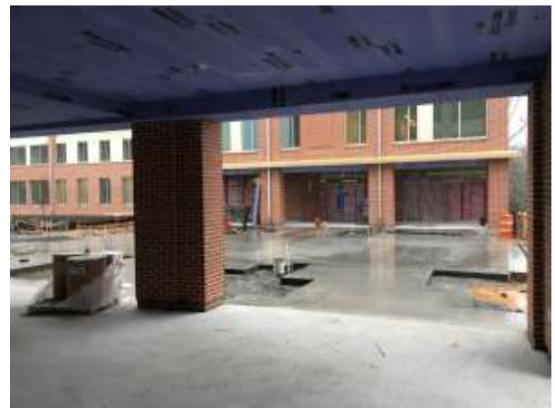
Building B Entrance Soffit & Sub-slab