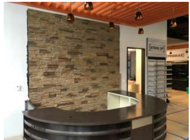
HUB Fresh Market