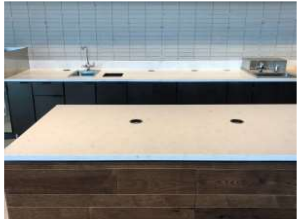
HUB Starbucks Tile & Counter Installation