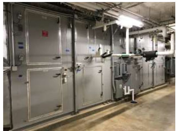
Building B ERV Test & Balance