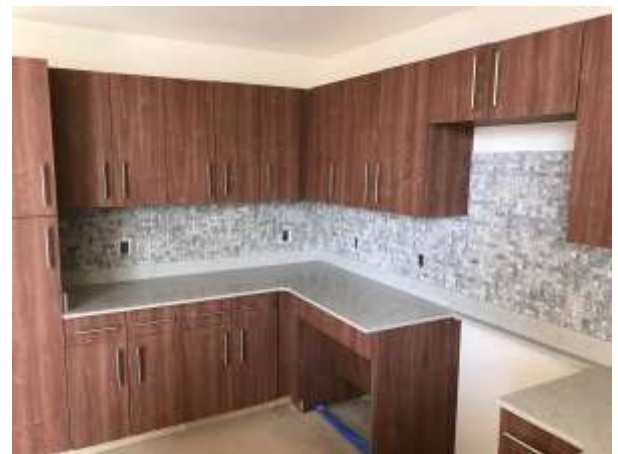
Building C Punch Preparation