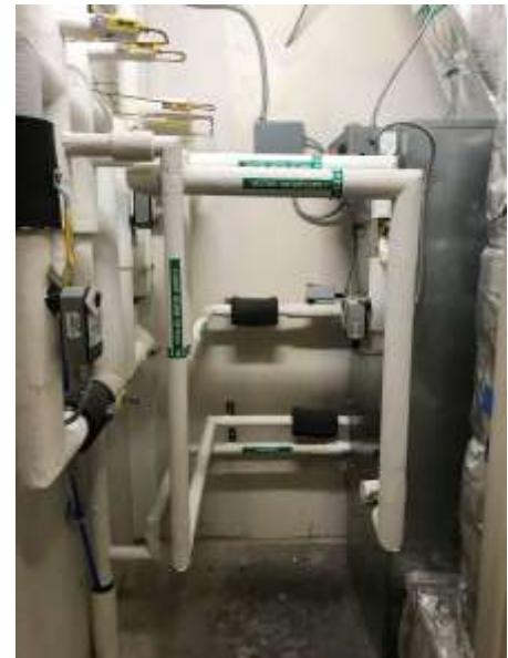
Building B FCUs Test & Balance