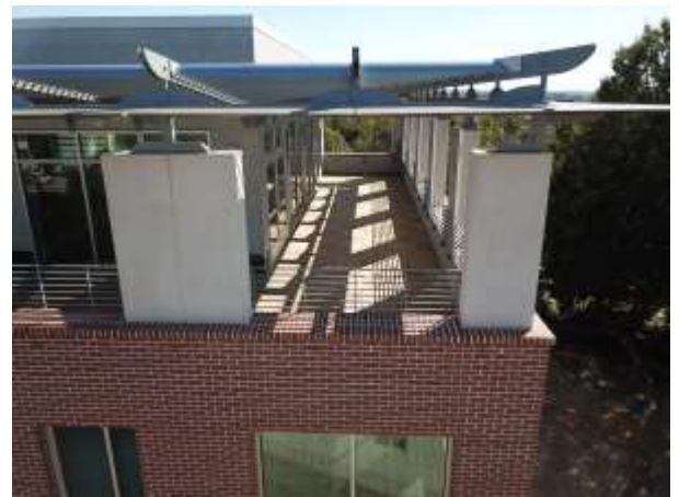
Building A Terrace