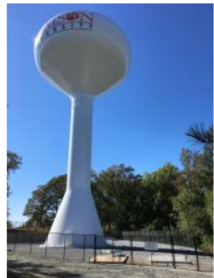
Kite Hill Water Tower Completion