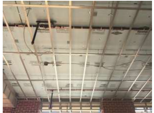
Building B Entrance Overhead