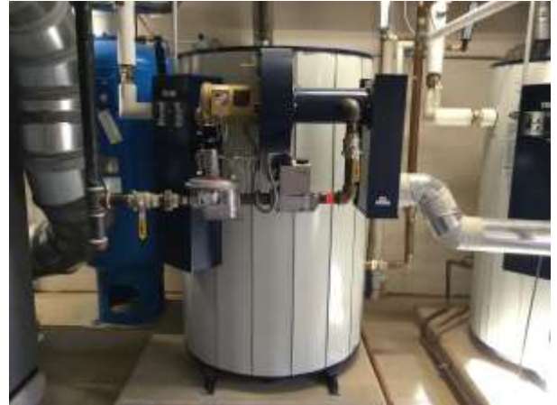
Building C Equipment Tie-ins