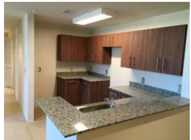
B1 Unit Punch