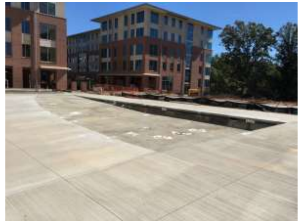
Water Deck at Building B