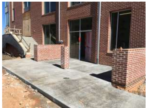
Hardscapes at Building B