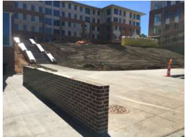
Hardscapes at Building D