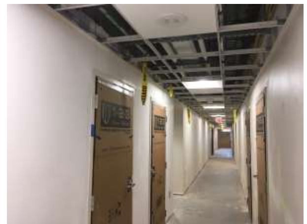
MEP Trim-out B1 Corridor