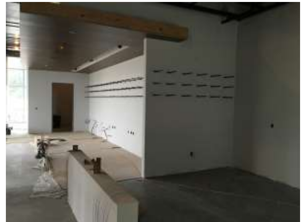
HUB Starbucks Café