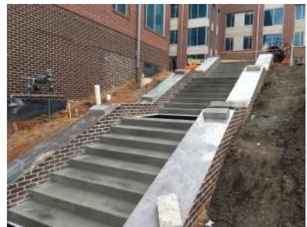
Building D Stairs Poured