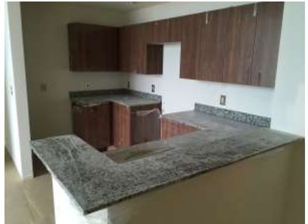
Granite Countertops D2