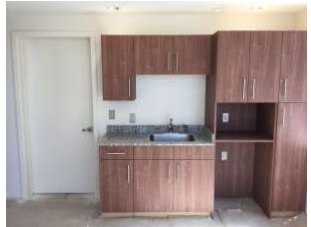
B2 Unit Punch