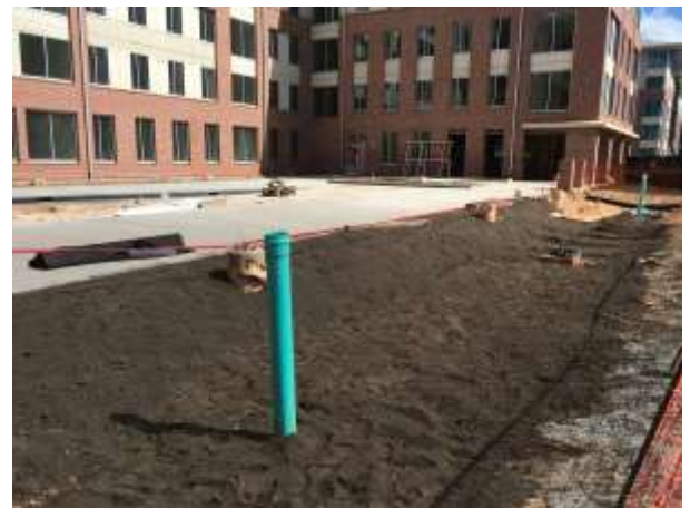
Building B Bio-Retention Cells & Pool Deck