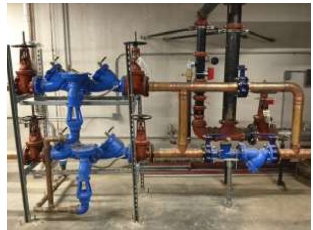
Building B Domestic Water