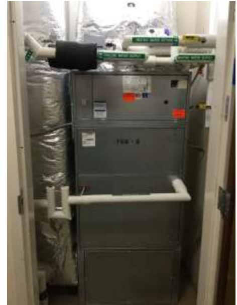
FCU Programming & Labeling