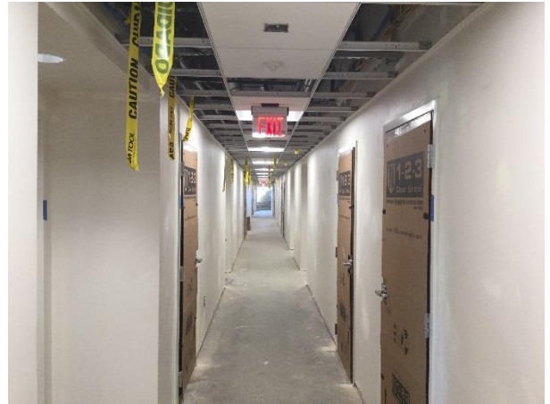
MEP Trim Out B1