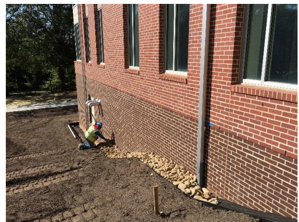
Drip Edge Progress West Zone