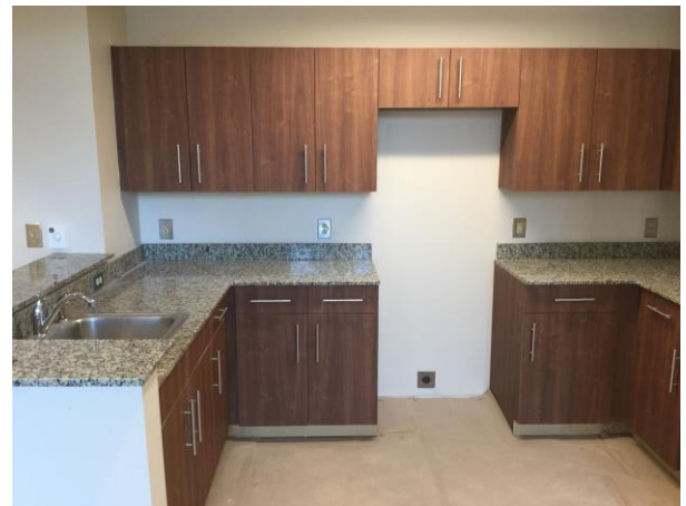
Construction Clean B1