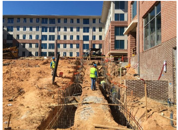
Footing Prep at Building C Steps