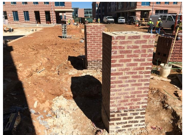
Masonry Columns at Building B Pool Deck