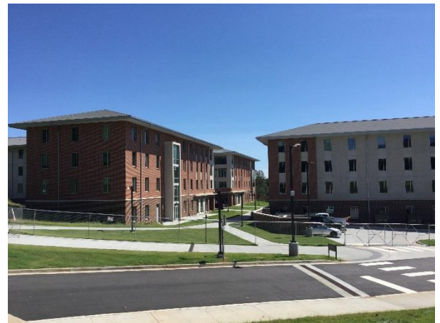
Certificate of Occupancy Received in the East Zone