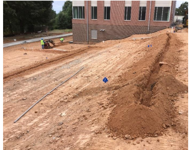
Final Grading & Irrigation Between A & C