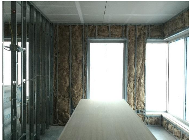
Insulating & Hanging on D6