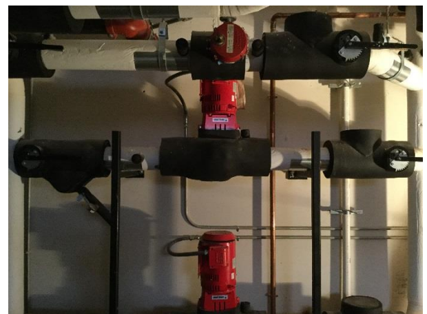
Chilled Water Piping Complete in Bldg. D