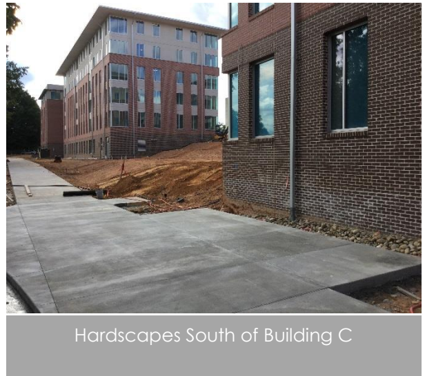
Hardscapes South of Building C