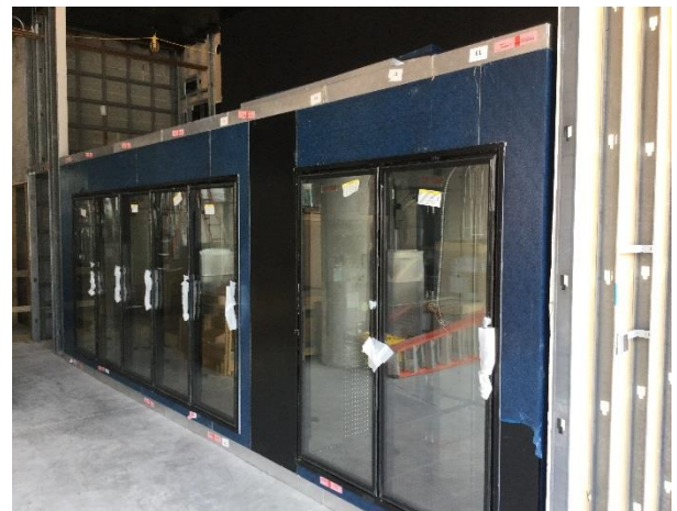
HUB Starbucks Freezers