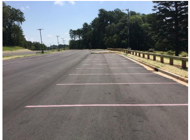
East Parking Lot Turnover