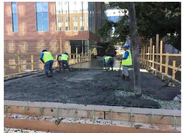
Pedestrian Bridge Topping Slab