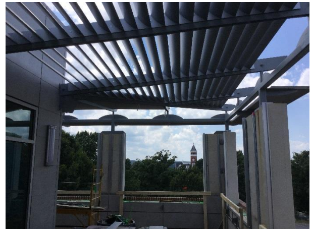
Building A Terrace Sunshades & Panels