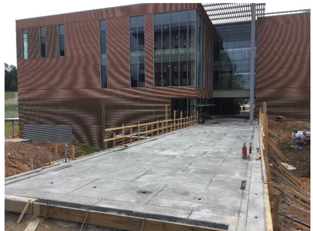
Pedestrian Bridge Slab