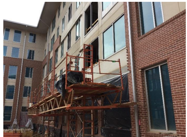
Building C Brick Masonry