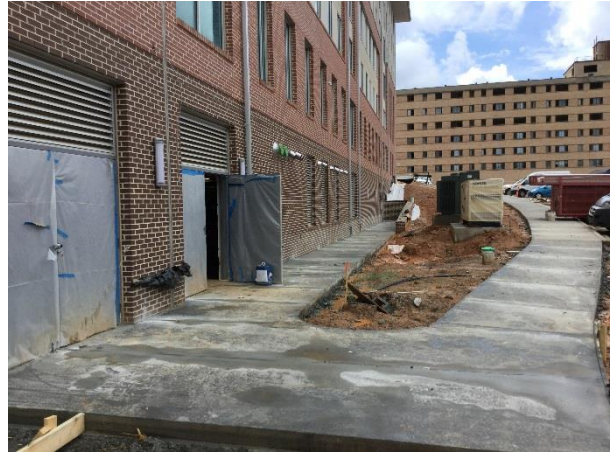
Building B Sidewalks