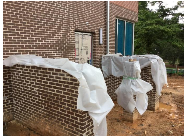
Building C Brick Site Walls