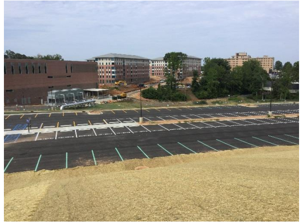
Northwest Parking Lot