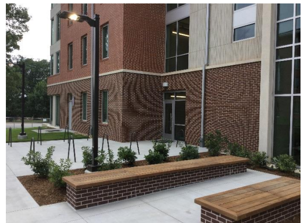
Building E Terrace