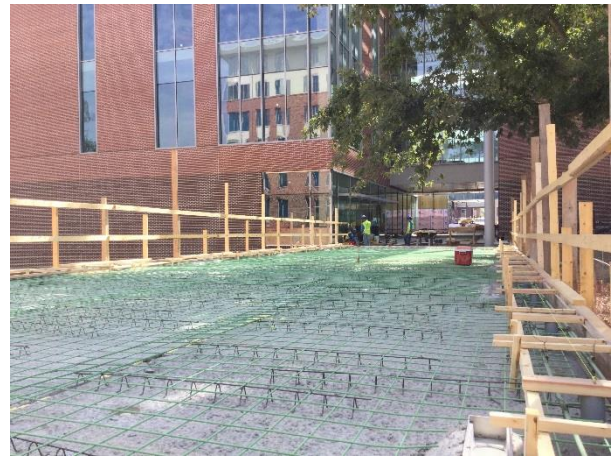
Pedestrian Bridge Slab Prep