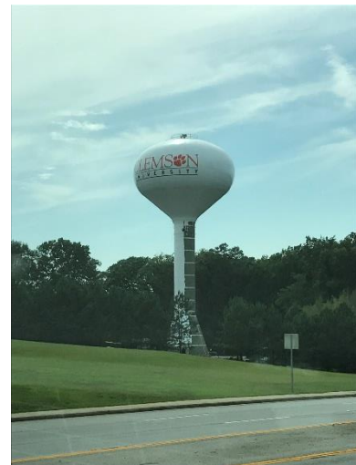
Kite Hill Water Tower