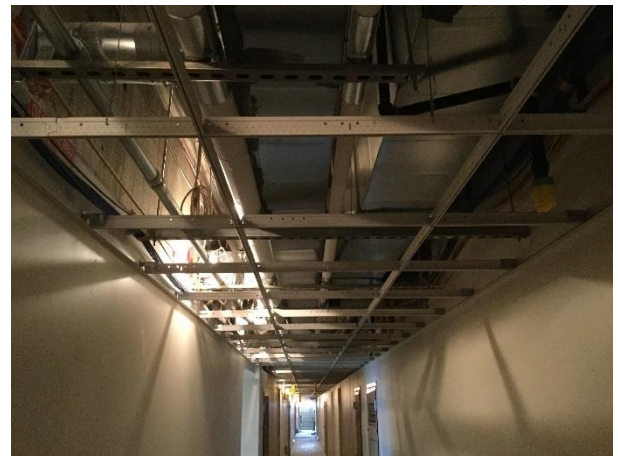
Ceiling Rough-in B1 Corridor