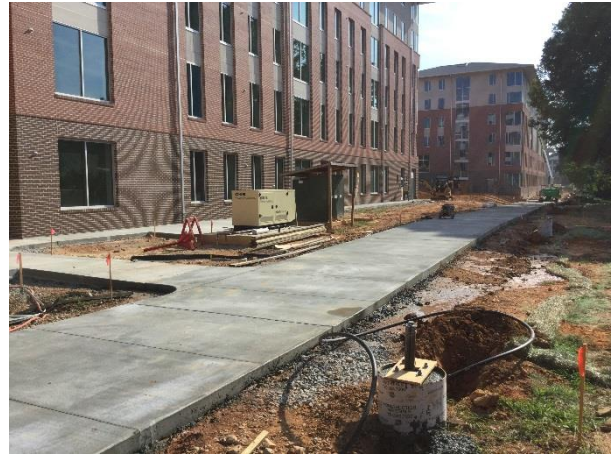
Hardscapes South of Building A