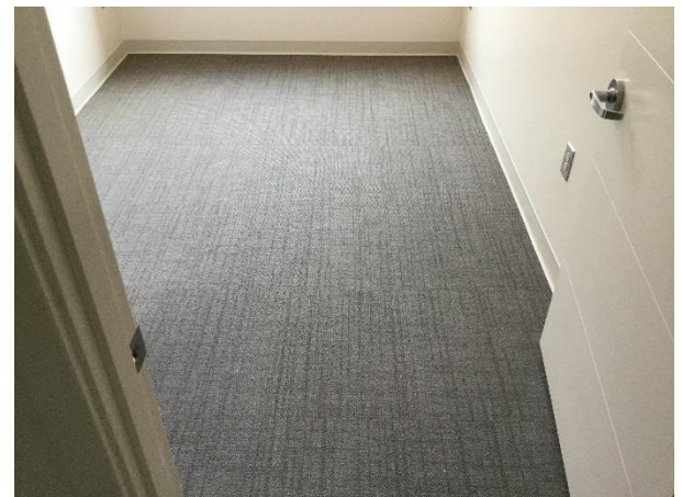
Carpet Installation Complete on A1