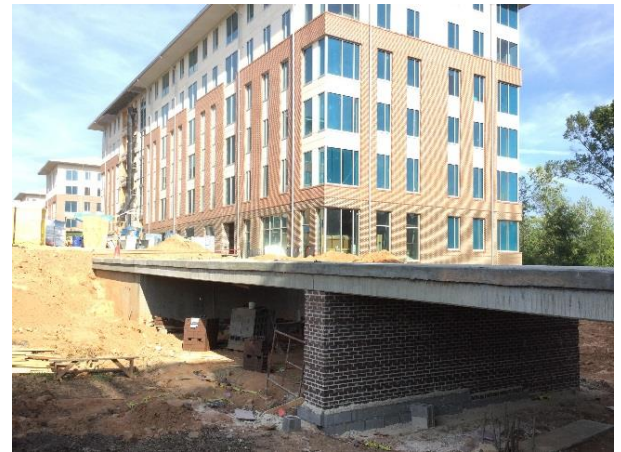
Pedestrian Bridge Brick Masonry