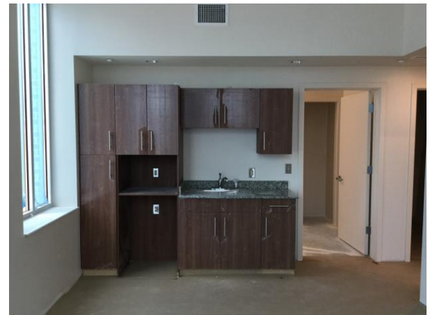
Building B Cabinets & Countertops