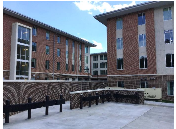
Building E Dumpster Pad Bumpers