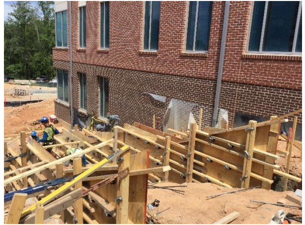
Building C Stair Walls