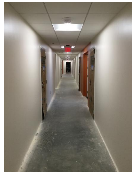
Building A Corridor Ceiling Tile