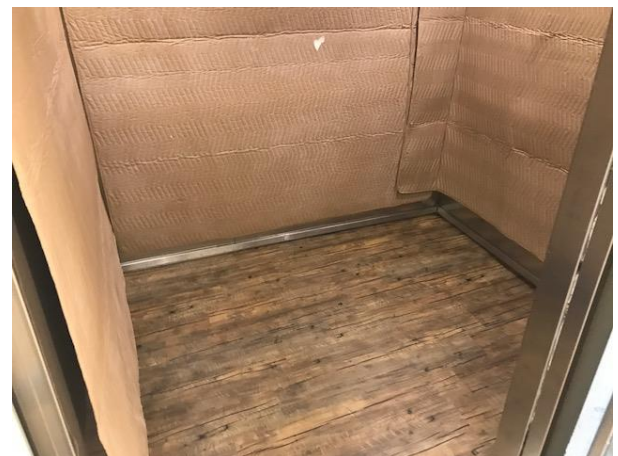
Building G Elevator Flooring