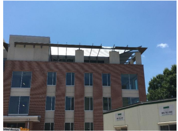
Building A Terrace Progress