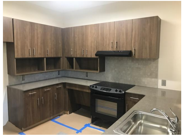
Building G Grad Apartment