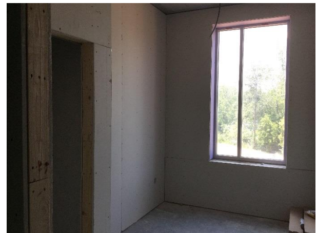
Building D Drywall