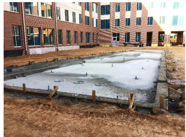
Building B Pool Progress