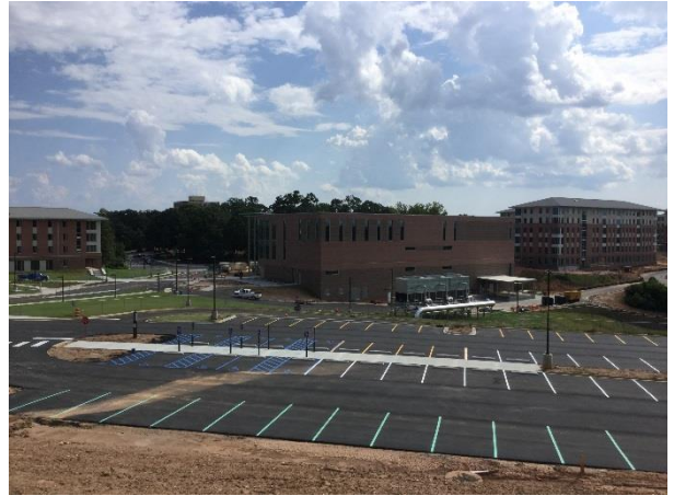
Northwest Parking Lot