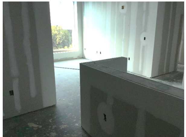
Building B 5 th Floor Apartment