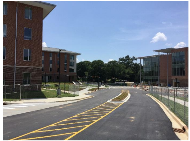
Cherry Road Open To Public