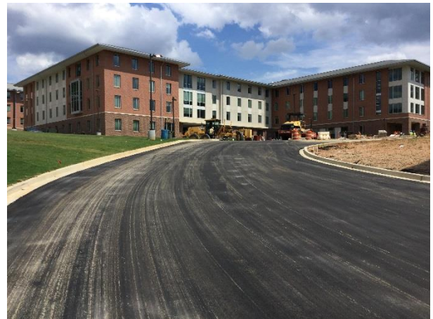
HUB Asphalt Pavement