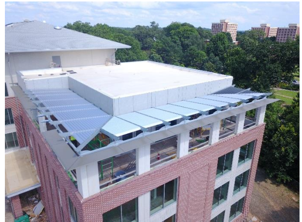
Building A Terrace Progress