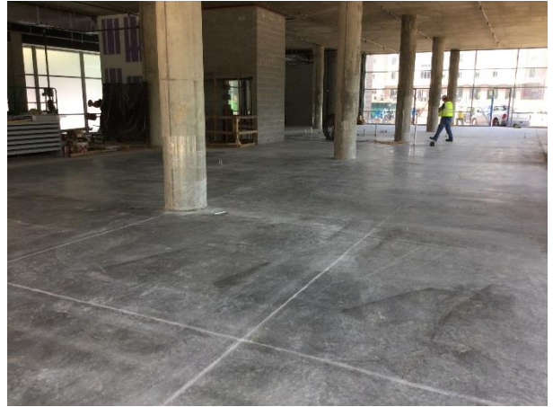
HUB Starbucks SOG