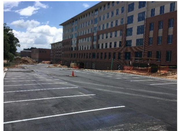
Building B Parking Lot