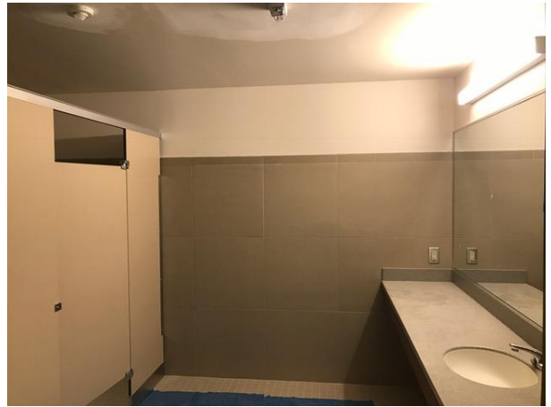
Building A Restroom