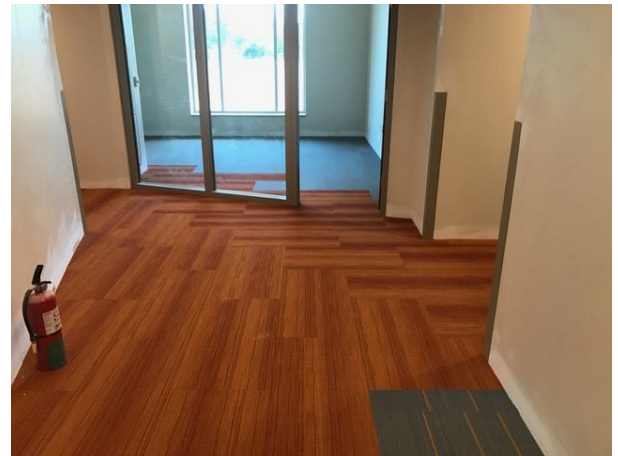
Building E Carpet