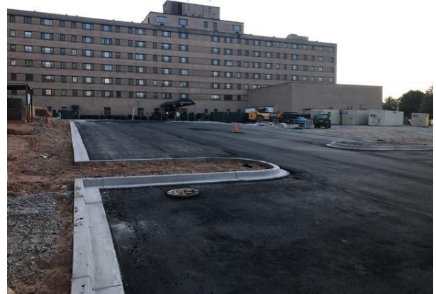
Building B Parking Lot