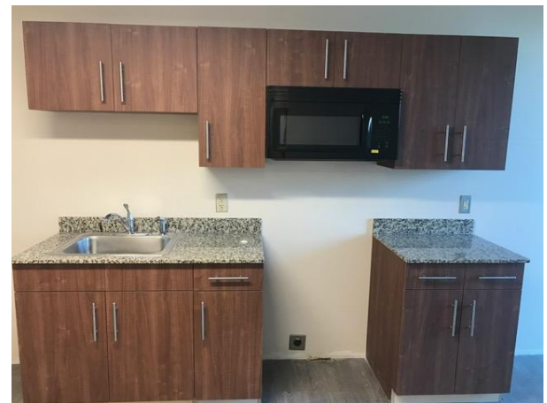
Building A Kitchen