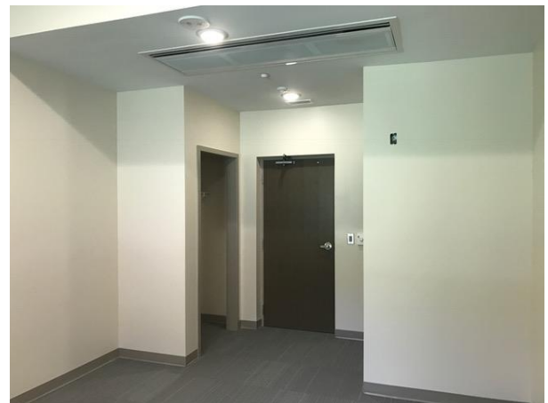
Building F Dorm Room