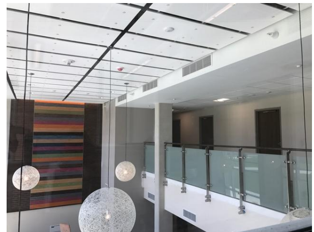
Building E Complex Lounge