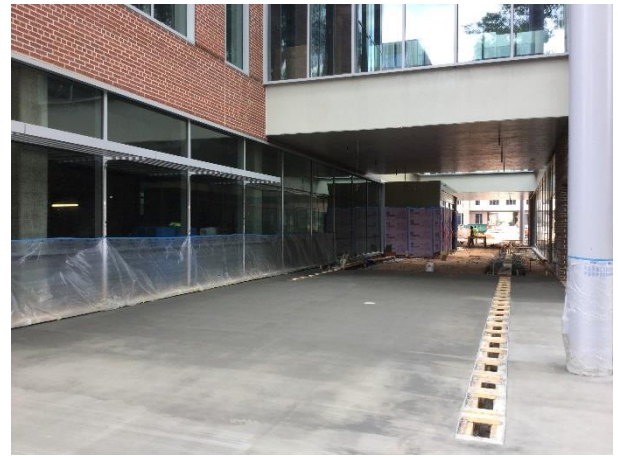
HUB Spine Concrete