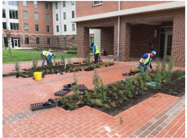
Planting in East Courtyard