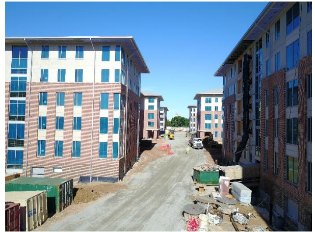
West Zone Spine