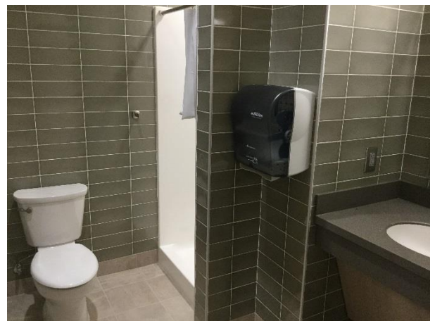
Building G Bathroom Finishes