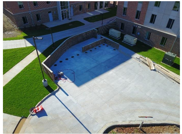
East Zone Dumpster Area