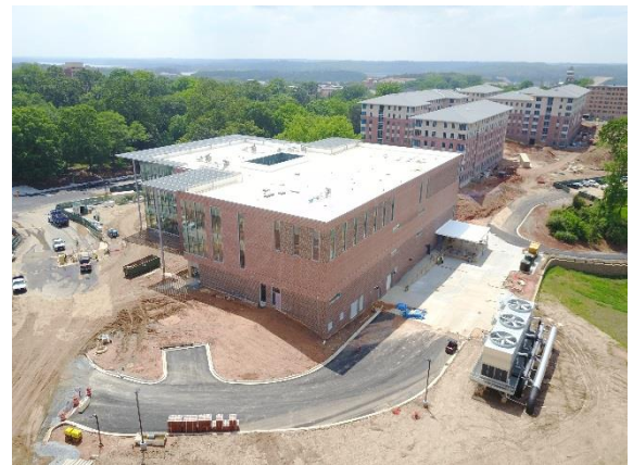
HUB Loading Dock