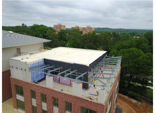
Building A Terrace