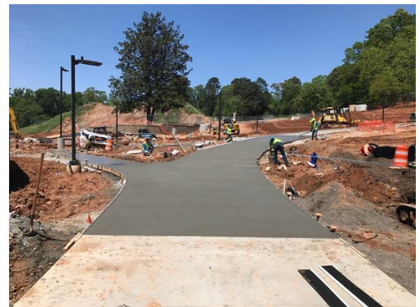
Sidewalk and Fire Lane West of Building F