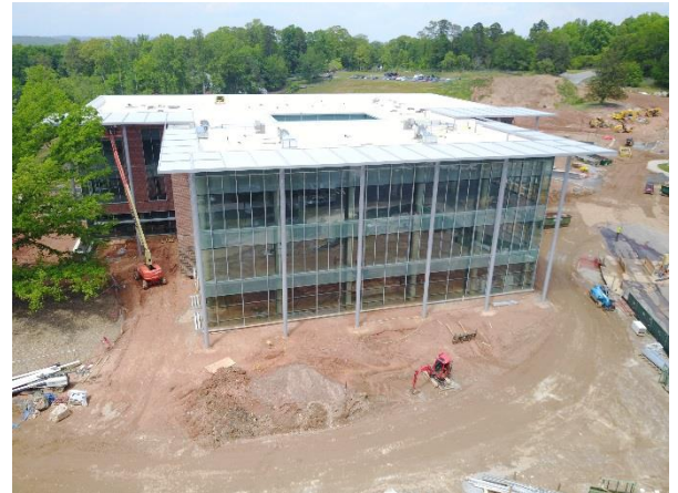
HUB Sunshade and Curtain Wall