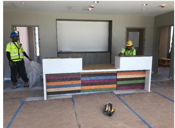
Building E Desk Installation