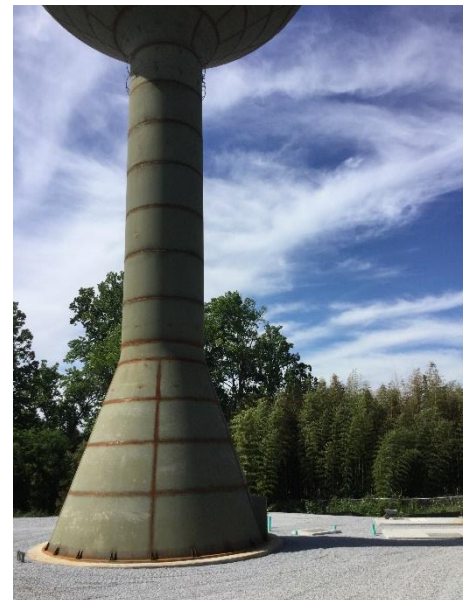
Kite Hill Water Tower