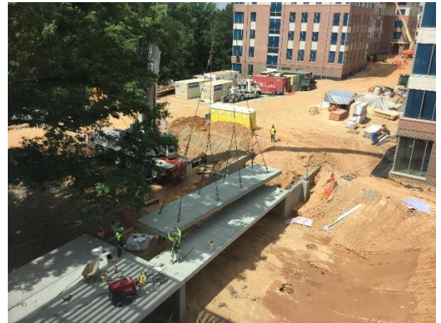
Pedestrian Bridge Precast