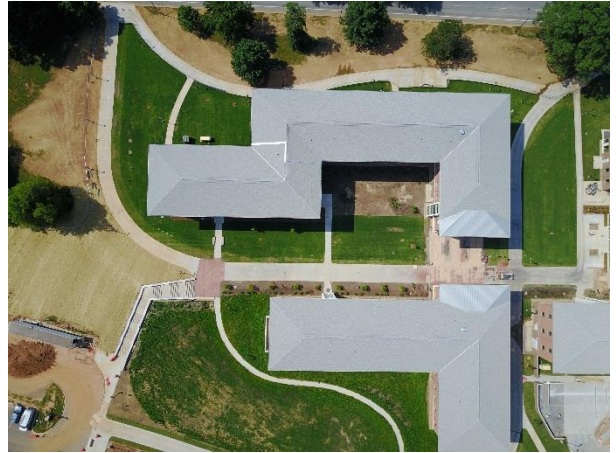
East Zone Overview