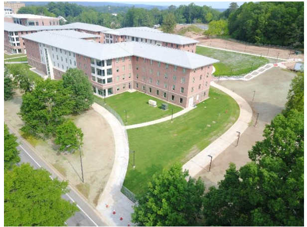
East Zone Perimeter Hydroseeding