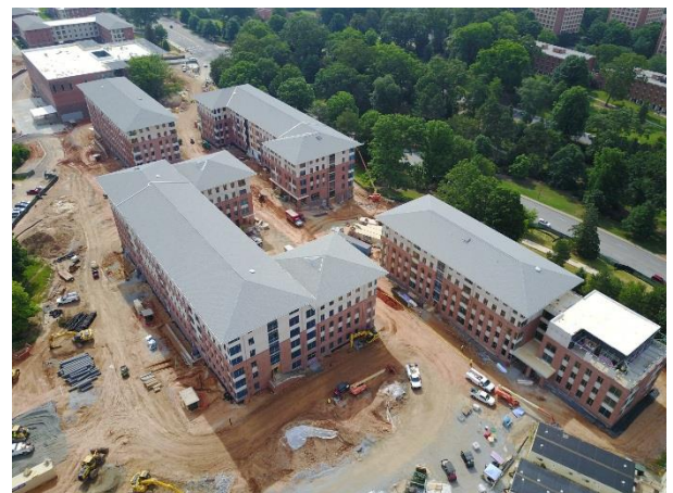
West Zone Progress