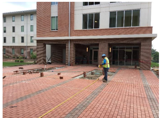
Brick Paving Install @ Bldg. G