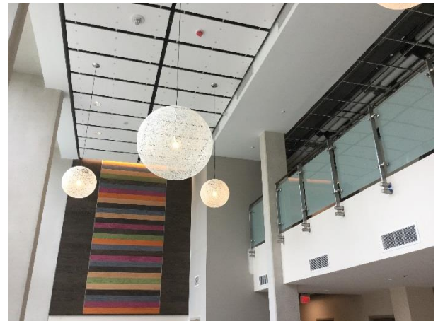
Building E Complex Lounge