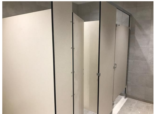
Bathroom Partions @ Building E Public Restrooms