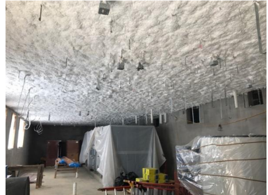
Building D Mechanical Room Insulation