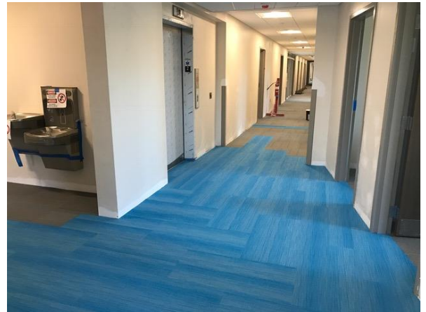
Carpet @ Building G 2nd Floor