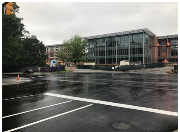
Cherry Rd Intersection