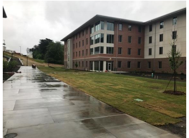
East Zone SOD