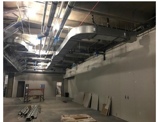
HUB First Floor Buildout