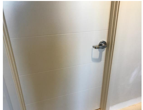
Building A Wood Doors and Hardware