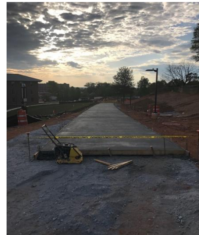
Firelane North of Building F