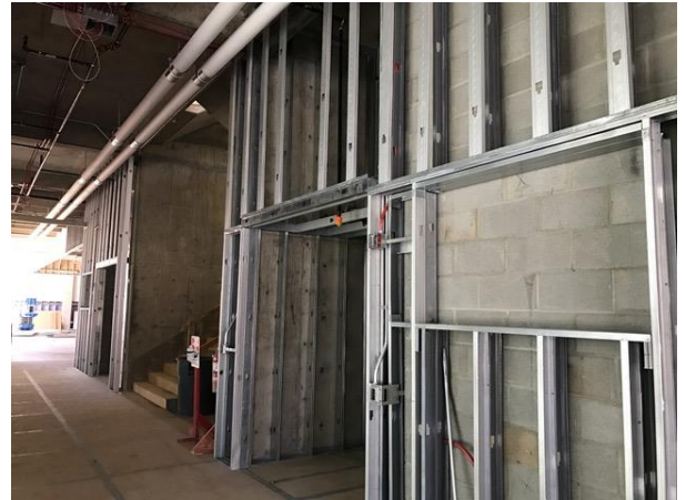
HUB Interior Framing – Elevator Lobby