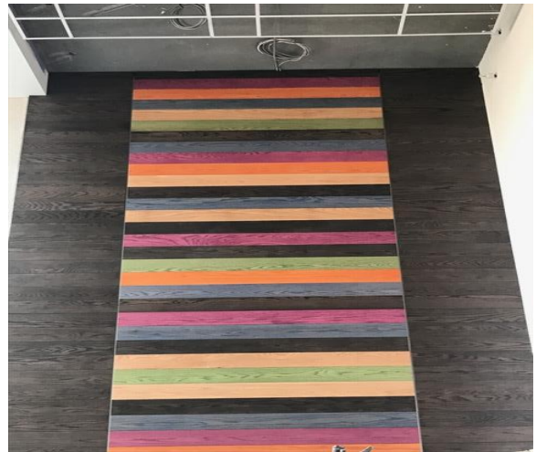
Building E Complex Lounge- Wood Feature Wall