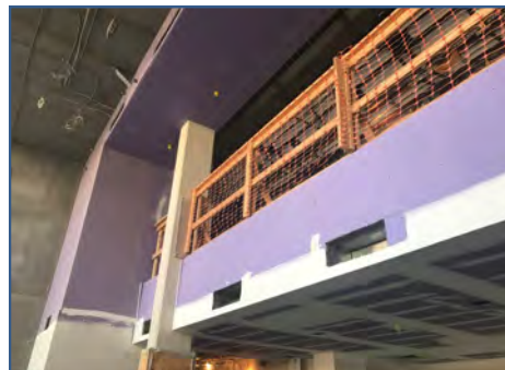
Building E Complex Lounge