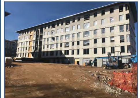
Building D Window Frames