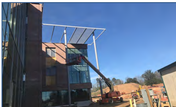
HUB Sunshade Infill