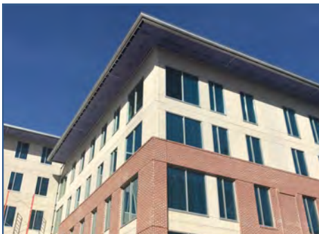
Building B DEFS