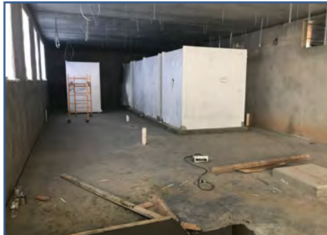
Building D ERV Unit