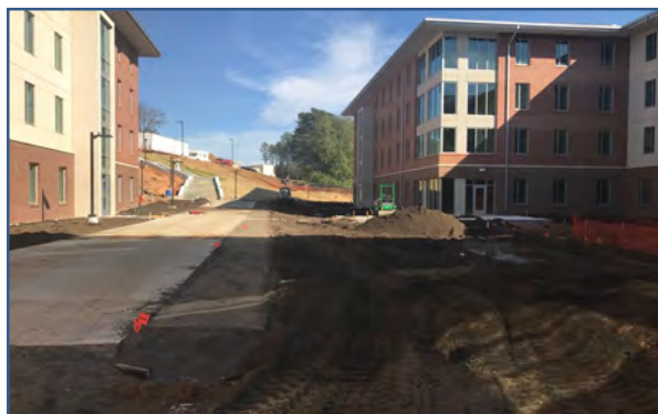
Top Soil Spreading