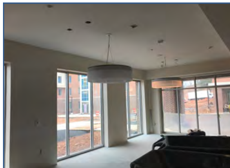
Bldg. G Main Lobby Light Fixtures