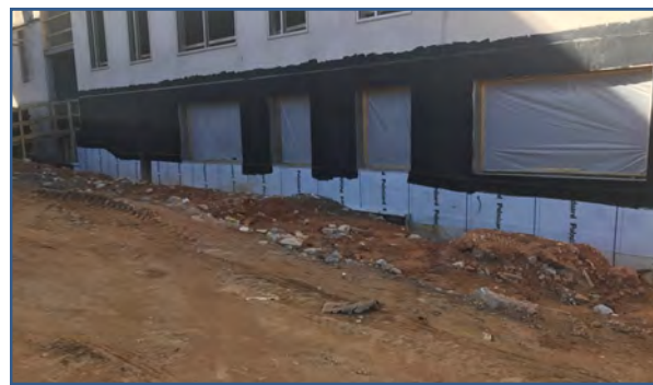
Building D Waterproofing