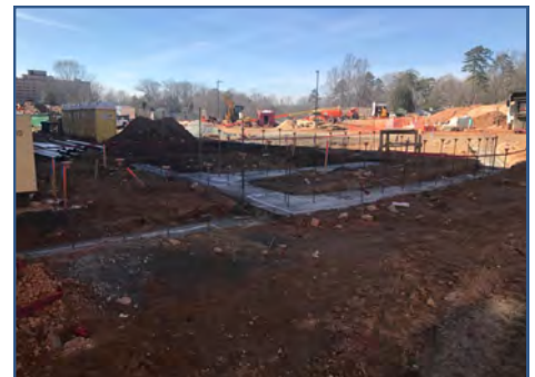
Dumpster Wall Foundations