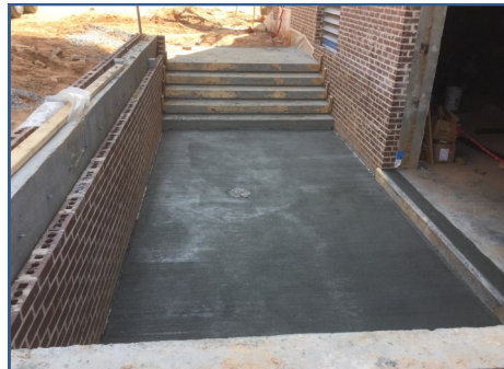
Bldg. E Areaway