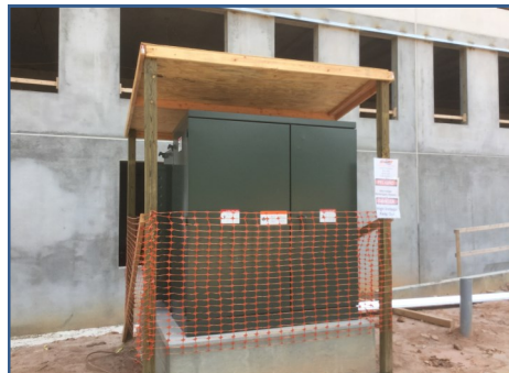
Bldg. B Transformer