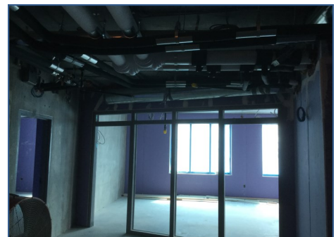
Bldg. F Storefront