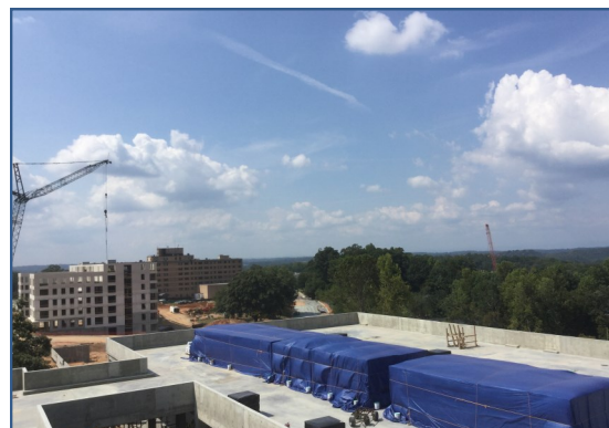
HUB Prep For Roofing