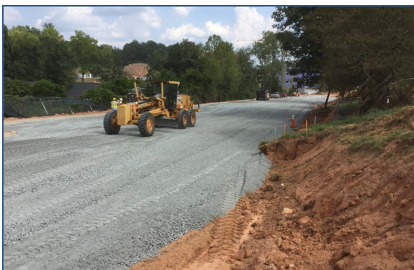
West Parking Lot Prep