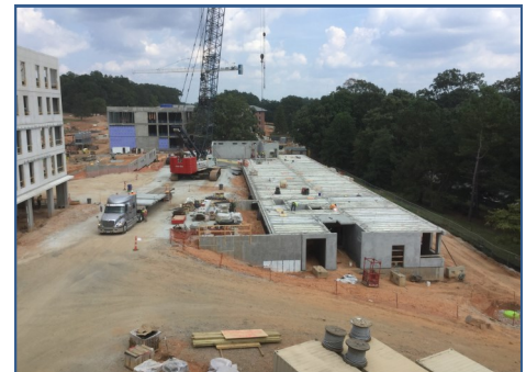
Bldg. C Precast