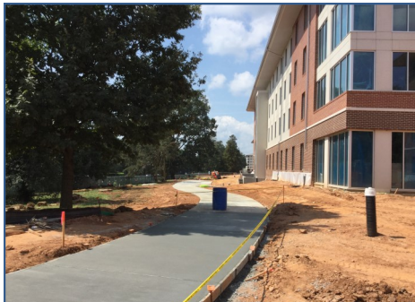
Bldg. G Sidewalks