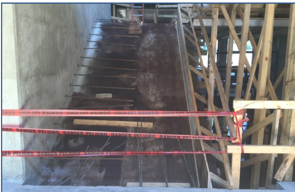
HUB Stair Forms