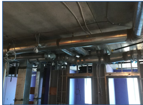
Bldg. E Overhead Rough-In