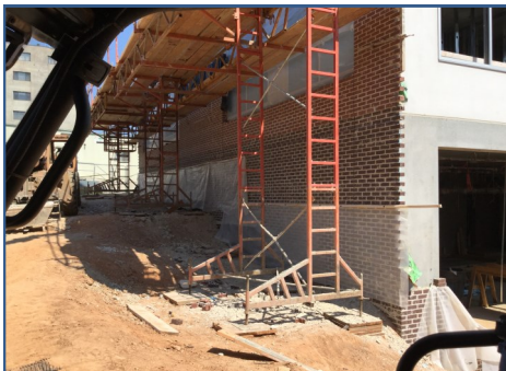
Bldg. A Brick