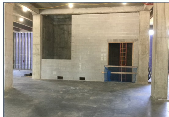
HUB CMU Wall