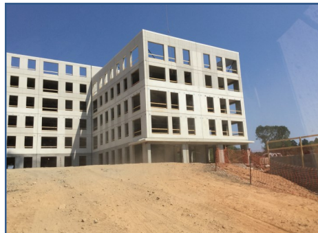
Bldg. B Completed Precast