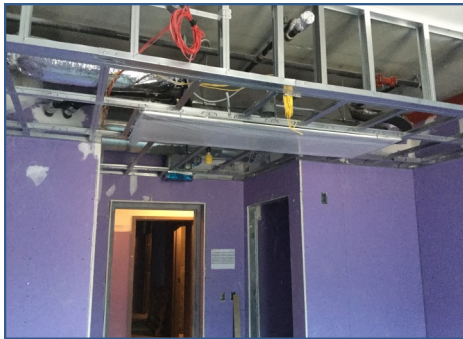
Bldg. G Interior Soffit Rough In