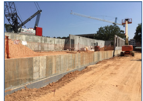
Bldg. C Precast