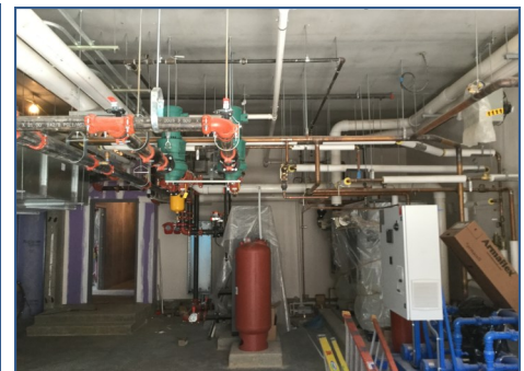
Bldg. F Mechanical Room