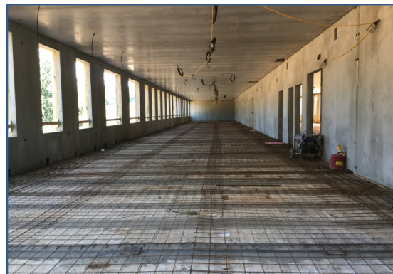
Building B 1st Floor Slab Prep