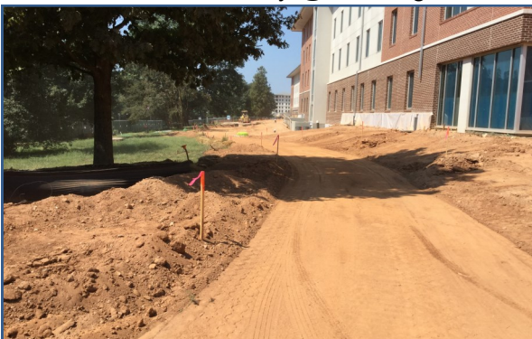
Final Grading For Sidewalks