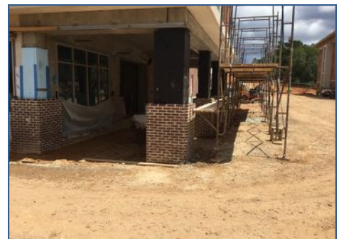
Bldg. F Columns