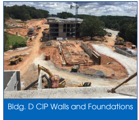
Bldg. D CIP Walls and Foundations