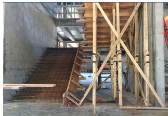
HUB Stair Forms