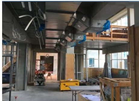
Bldg. E Overhead Rough In