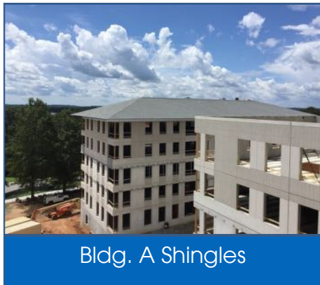
Bldg. A Shingles