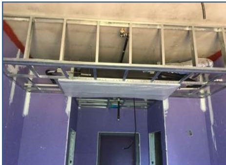
Bldg. G Interior Soffit Framing