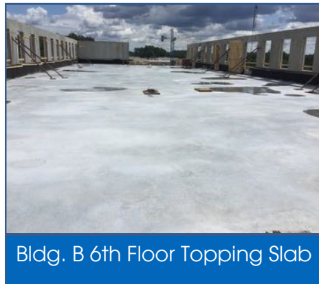
Bldg. B 6th Floor Topping Slab