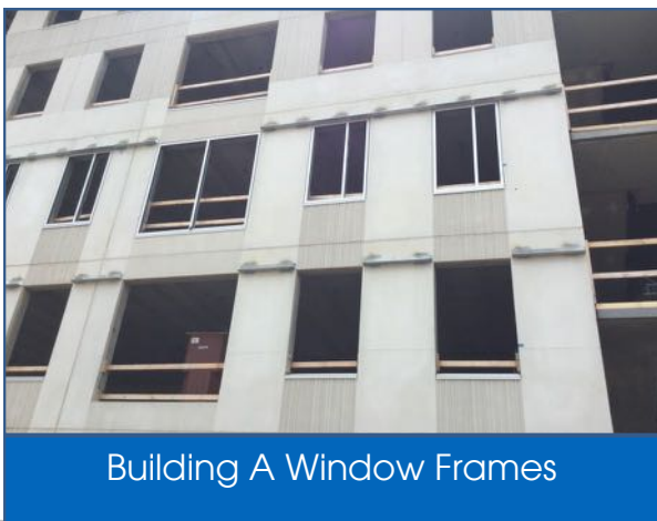
Building A Window Frames