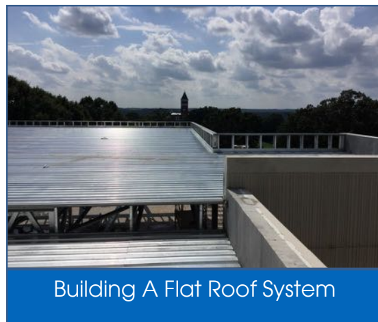
Building A Flat Roof System