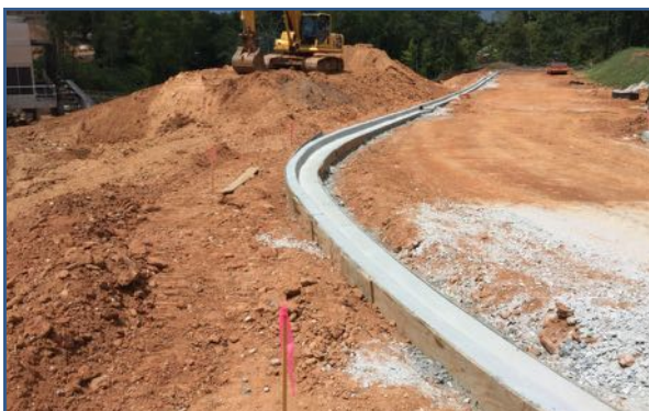
Martin Street Curb and Gutter