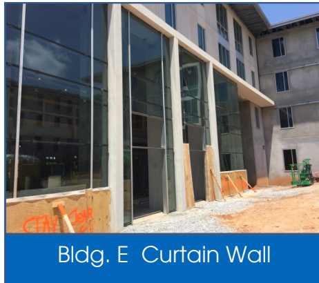
Bldg. E Curtain Wall