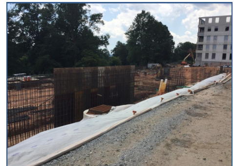
Bldg. C CIP Walls