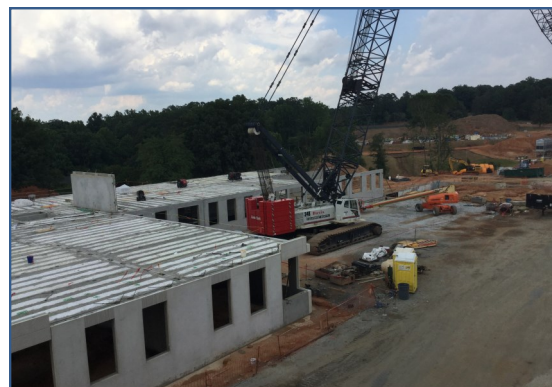
Building B Precast