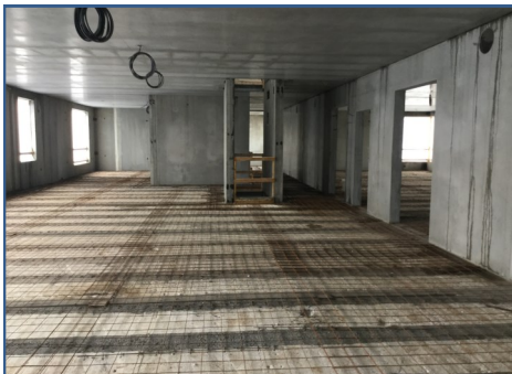
Bldg. A 4th Floor Slab Rough-In