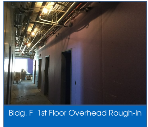
Bldg. F 1st Floor Overhead Rough-In