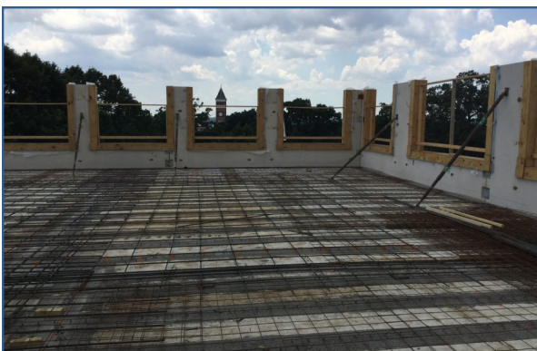
Building A 4th Floor Topping Slab Rough-In