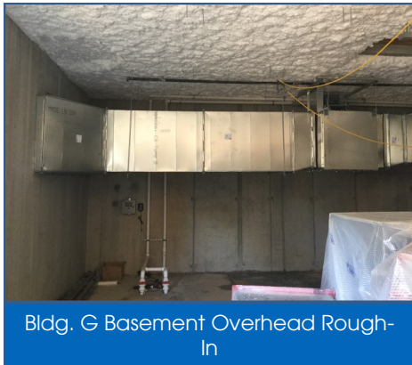
Bldg. G Basement Overhead Rough-In