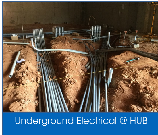
Underground Electrical @ HUB