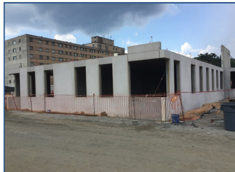
Bldg. B Precast