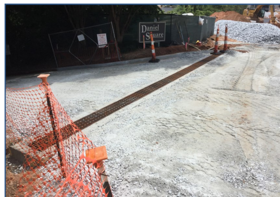
Trench Drain at Daniel Square Entrance