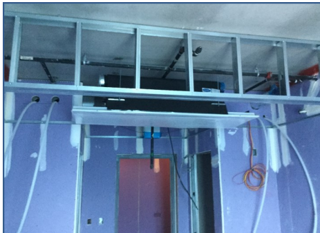
Bldg. G IDU Units