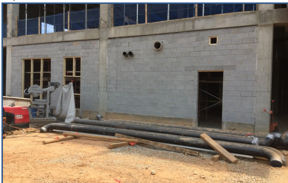
HUB CMU Walls