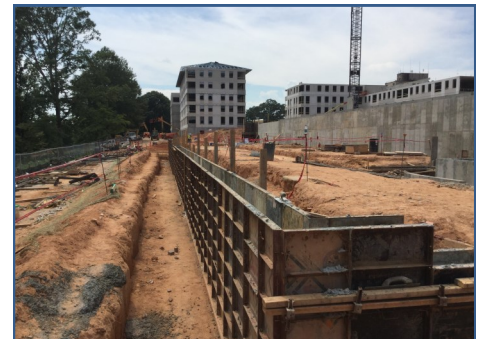
Bldg. C Stem Walls