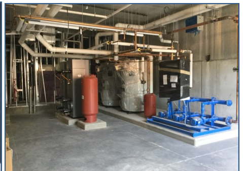
Bldg. F Mechanical Room