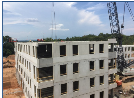
Bldg. B Precast