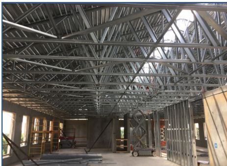
Bldg. A Roof Trusses & Decking