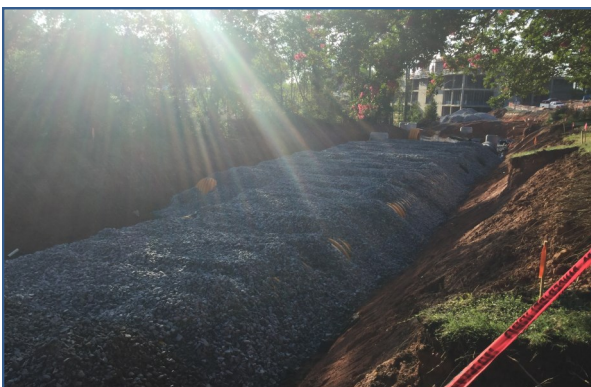
Chambers at Underground Detention