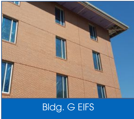
Bldg. G EIFS