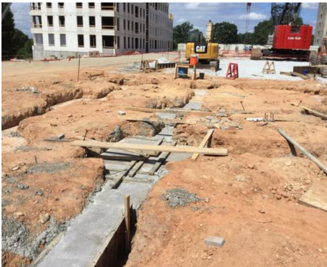
Building B Foundations