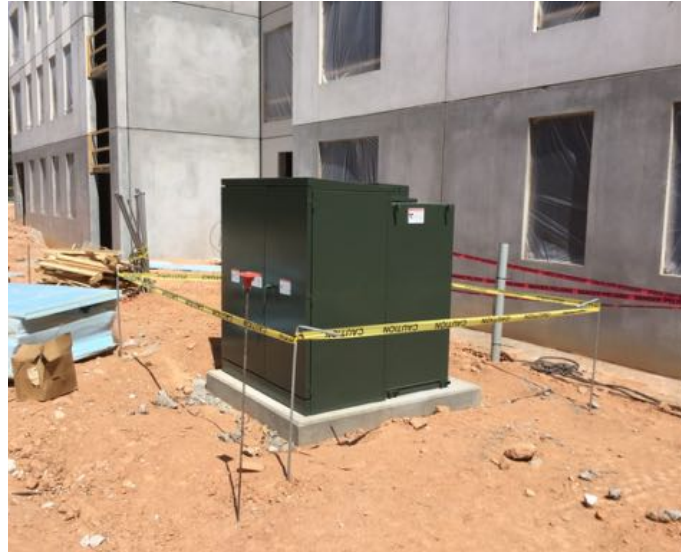
Building A Transformer