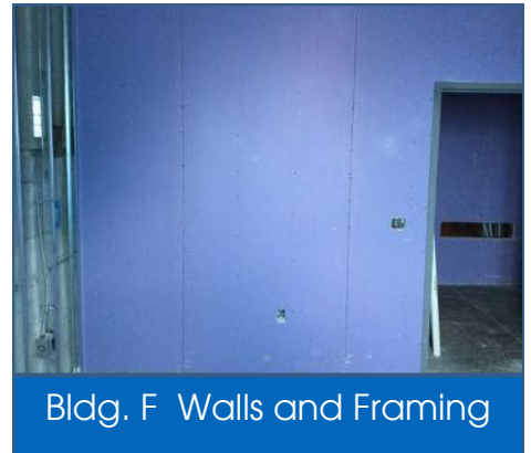
Bldg. F Walls and Framing