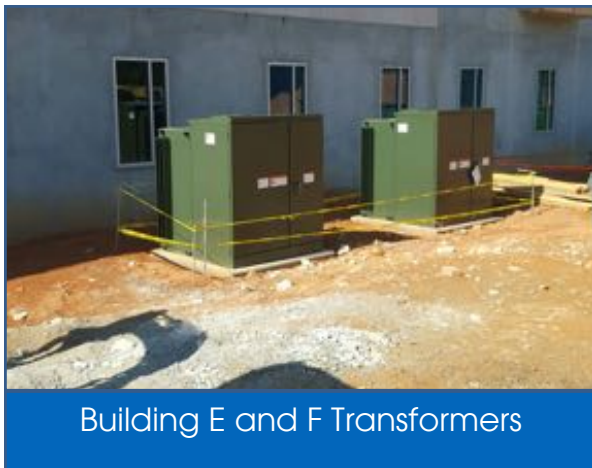
Building E and F Transformers