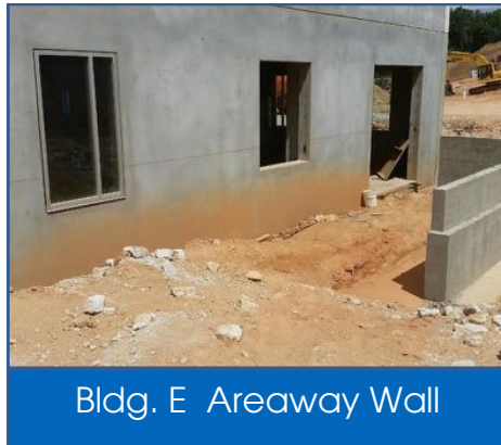
Bldg. E Areaway Wall