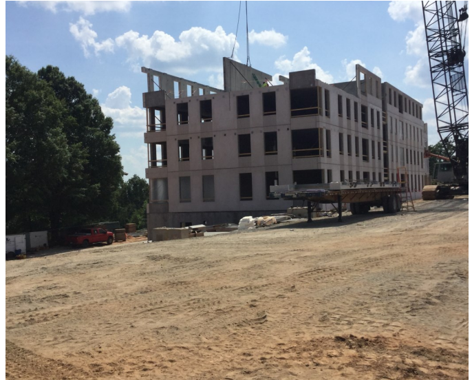
Building A Precast