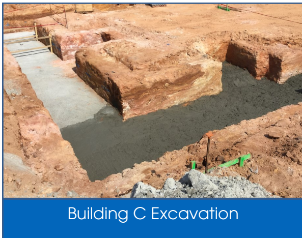
Building C Excavation