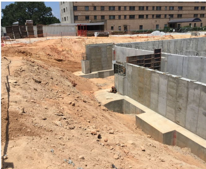
Building B Stem Walls