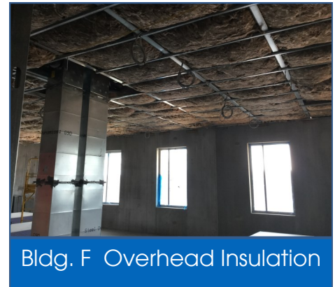
Bldg. F Overhead Insulation