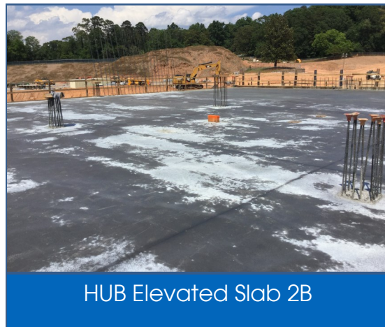
HUB Elevated Slab 2B