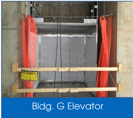
Bldg. G Elevator