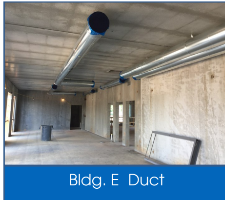
Bldg. E Duct