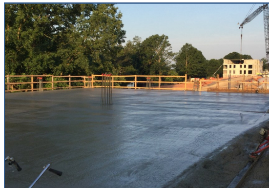
HUB Elevated Slab 2A