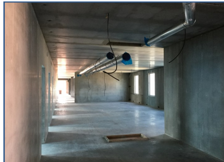
Bldg. E Duct