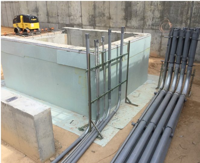
Building B Elevator Pit