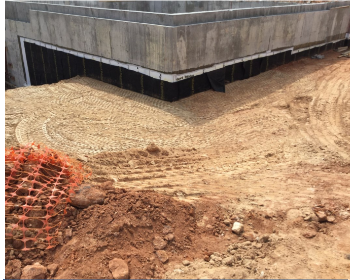
Building B Backfill