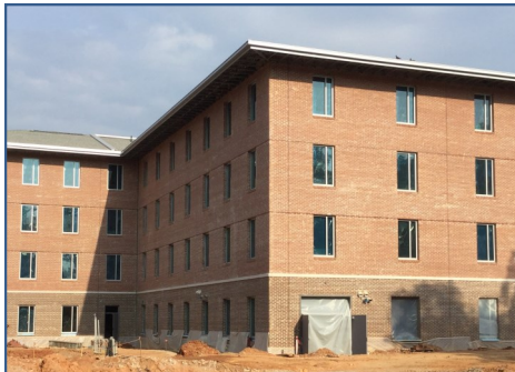
Bldg. G Brick